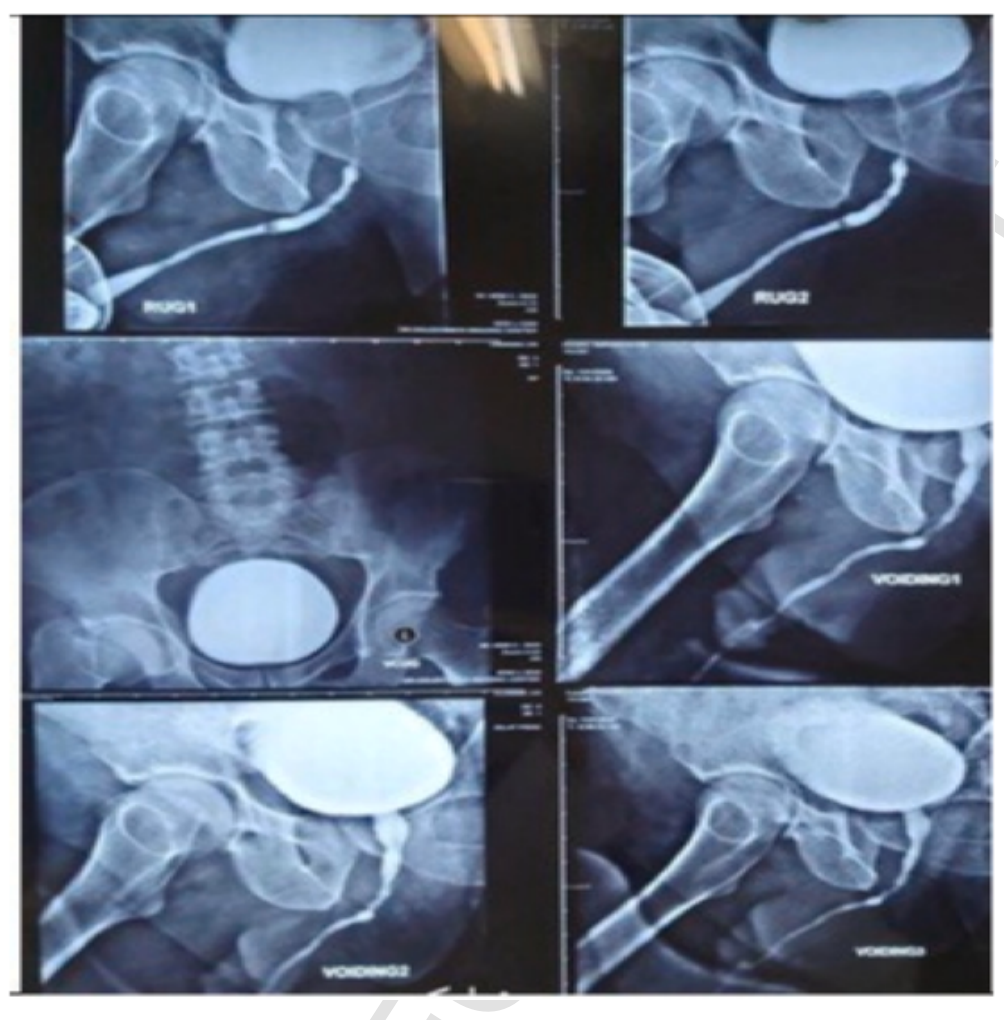
Fig. 2. RUG and VCUG that shows Urethral stricture.