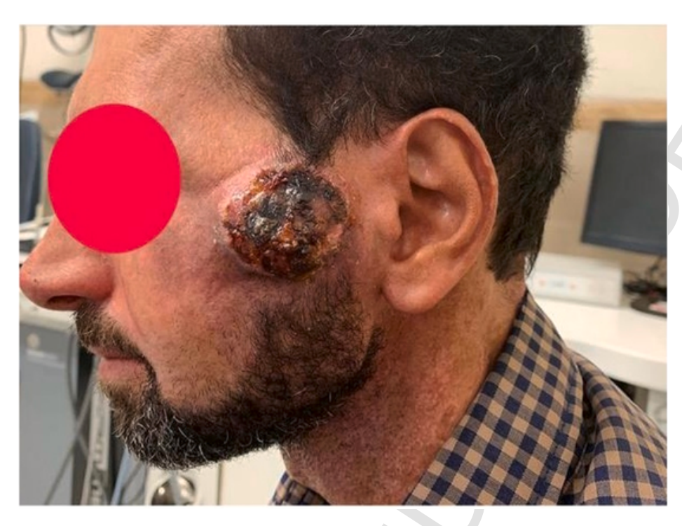
Fig. 1. Temporal SCC.

tients.<sup>2</sup> A detailed review of major genitourinary complications (meatal stenosis, urinary retention, bladder hypertrophy, hydronephrosis, and pyelonephritis) from the American National EB Registry was presented by Fine et al., in 2004.<sup>4</sup> They also evaluated the outcomes of the performed procedures in patients with EB. They concluded that urological problems are often noticeable in patients with more severe subtypes; JEB and the recessive DEB variant Genitourinary complications of inherited epidermolysis bullosa: experience of the national epidermolysis bullosa registry.<sup>4</sup>